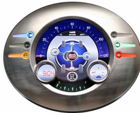
Figures 1 and 2. Yazaki Instrument Panel Clusters

90. Instrument Panel Clusters are installed by automobile original equipment manufacturers (“OEMs”) in new vehicles as part of the automotive manufacturing process. They